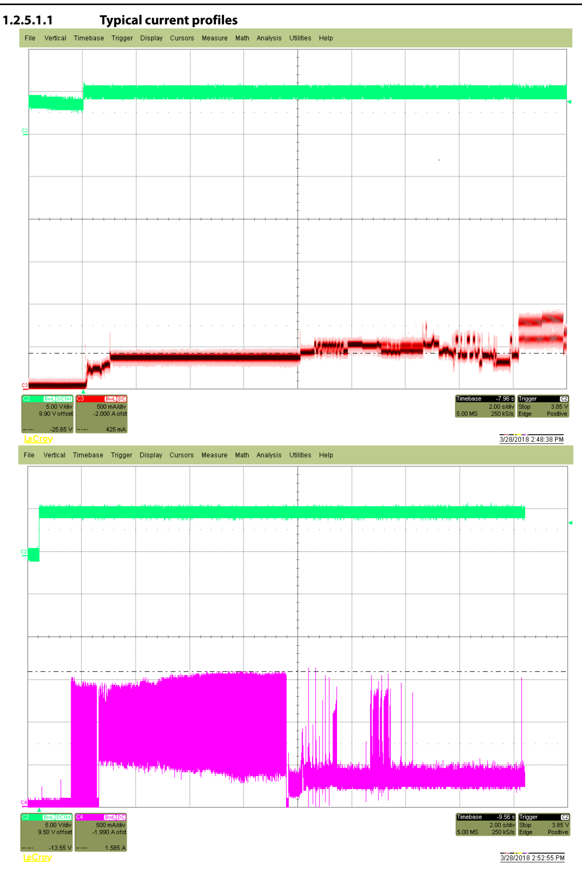
Figure 1. Typical 5V and 12V startup and operation current profiles